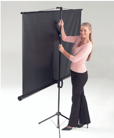
Integrated carrying handle